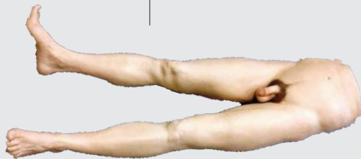
NICL LOWER UNIT

(Optional accessories where noted - some items may not be included)